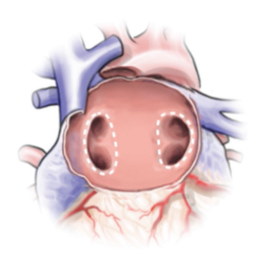
Endocardial: Inside the Heart

Endocardial ablation creates lesions on the inside of the heart and is most often used to treat paroxysmal Afib.